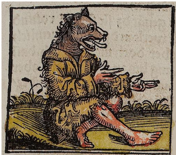
Fig. 4: Dog-headed people (Cynocephali) : 'In India there are people with dogs' heads who bark when they speak. They nourish themselves with birdsong and dress in animal skins'.

The interesting and entertaining group of monstrous races provided occasion for various reflections on the history of salvation and divinely ordained nature and its playfulness and regularity. Accounts of monstrous races can be found in the high and late mediaeval encyclopedias and descriptions of nature and occasionally in chronicles (for example those of Vincent of Beauvais, Gauthier of Metz, Gervase of Tilbury, Konrad of Megenbergh, Brunetto Latini and Adam of Bremen). 41 Living far as they did from the Christian heartland, they offered scant occasion for horror and fear. Hartmann Schedel, who published a world chronicle in 1493, 42 classified the monstrous races as belonging chronologically to the second aeon (of seven), which extended from the Great Flood to the birth of Abraham, and thus placed them at a great temporal distance. Schedel presents a total of 21 monstrous races with illustrations, some of which he elucidates briefly (in what follows we begin with the usual term, and then give Schedel's translated explanation):