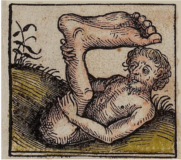
Fig. 8: Shadow feet (sciapods) : Schedel offers no explanation. The sciapods are known for having such a big foot that it provides them with shade.

Fig. 7: Hermaphrodites : 'Many [in Libya] are of both sexes. The right side of the breast is male, the left female. They mate with one another and produce offspring'.