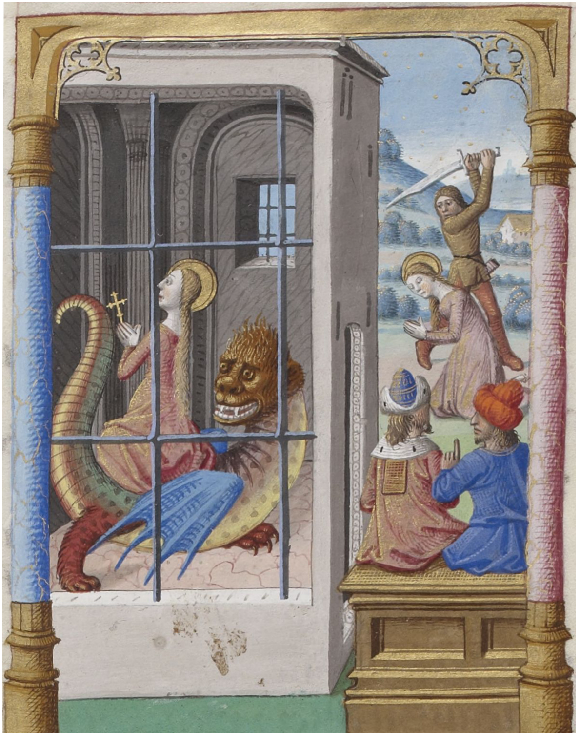
Fig. 1: The Martyrdom of St Margaret

St Margaret, according to Jacobus de Voragine, lived in Antioch at the time of the Roman Empire and was a great beauty. Margaret converted to Christianity against her father's