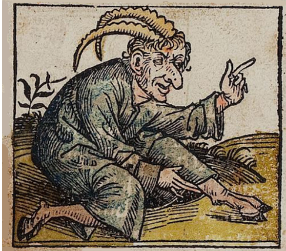
Fig. 10: '[In Ethiopia] many have horns, long noses and goats' feet, about which you can read in the legend of St Anthony'. (Here Schedel includes the demons that St Anthony went looking for in the desert in the list of monstrous races.)

The interest in individual monsters rose sharply in the fifteenth century, with a remarkable shift. The monsters were no longer located as peoples or races in distant lands or eras, but now were born as individuals on one's own doorstep, in Cracow, Zurich or Florence. These monstrous births were recorded and disseminated through the printing press. A famous example is the monstrum of Ravenna. 43 According to the first Italian broadsheets this birth occurred in Florence in 1506, bringing forth a hermaphrodite with the limbs of various animals, lending it quite a monstrous appearance 44 :