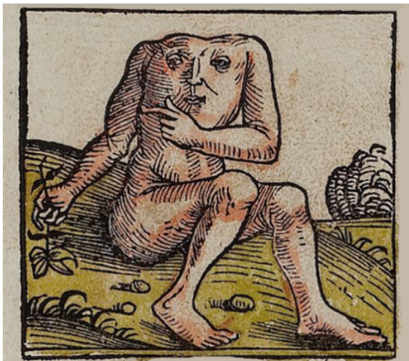
Fig. 6: Headless/Chest-faced people (Acephali) : 'In Libya many are born without a head, [but] have a mouth and eyes'.