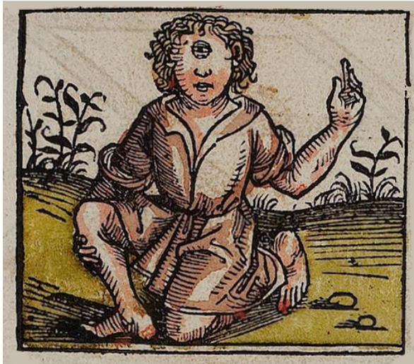
Fig. 5: One-eyed people (Cyclopes) : 'Many [in India] have but one eye on their forehead over the nose and eat only animal flesh'.