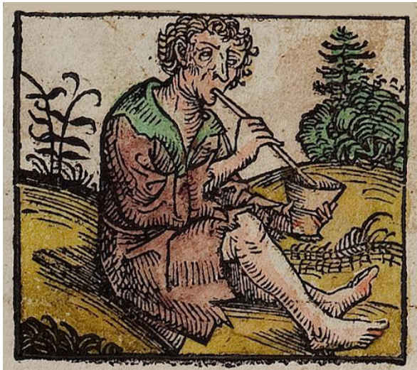
Fig. 9: Mouthless people (Astomi) : 'Near Paradise [located in the farthest corner of the Orient] on the River Ganges live people who do not eat, for their mouths are so small that they must drink through a straw. They live from the scent of apples and flowers and die the moment they smell something bad'.

Fig. 8: Shadow feet (sciapods) : Schedel offers no explanation. The sciapods are known for having such a big foot that it provides them with shade.